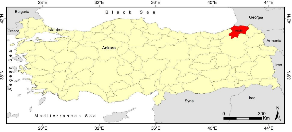
Figure 2: Location of the study area.